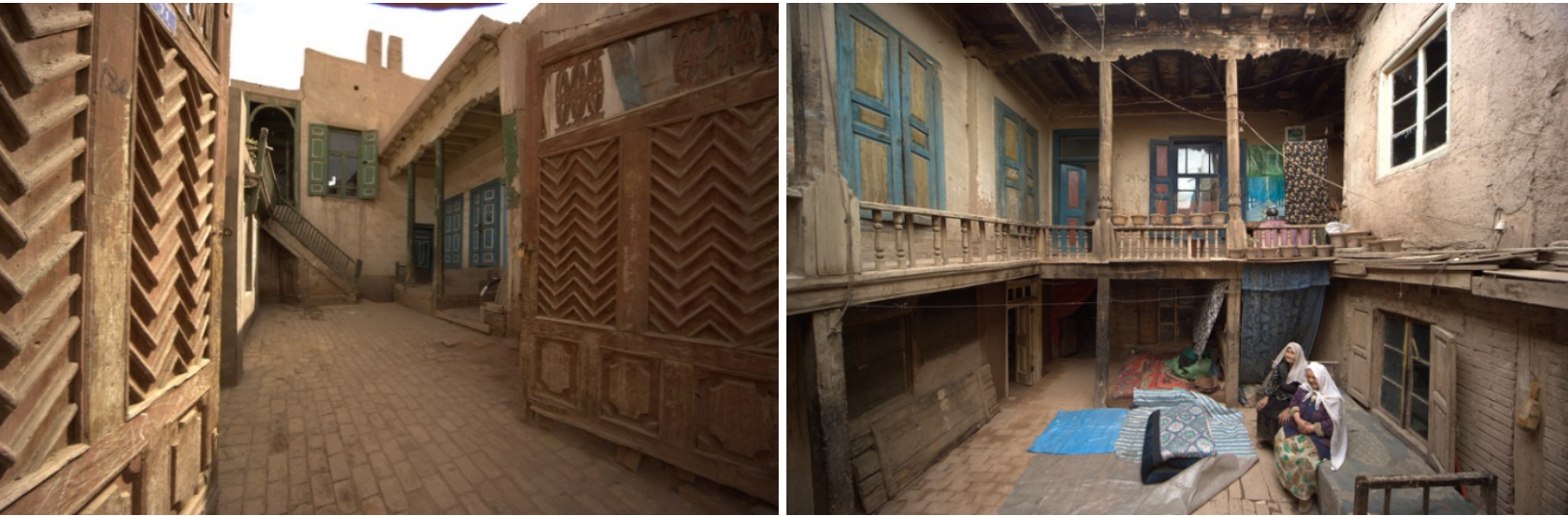
Interconnected rooftops of the Old City , 2005; Gollings, John. “Kashgar Old City”. Figshare, September 23, 2016.

The collective social, religious, and economic institutions of Kashgar’s Old City allowed for a degree of relative insulation from the Chinese state, and, by extension, a place of hope for the freedom and cultural self-determination of the Uyghur people as a whole.