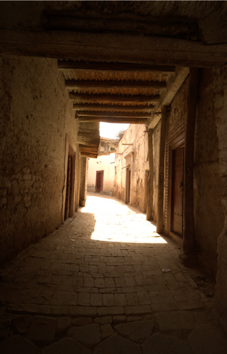
Labyrinthine mudbrick alley, pre-reconstruction, 2005