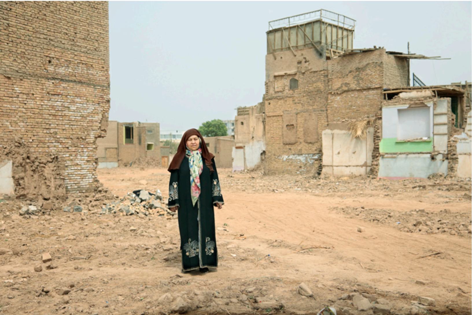
Kashgari woman standing on the site of her former home, August 2011.