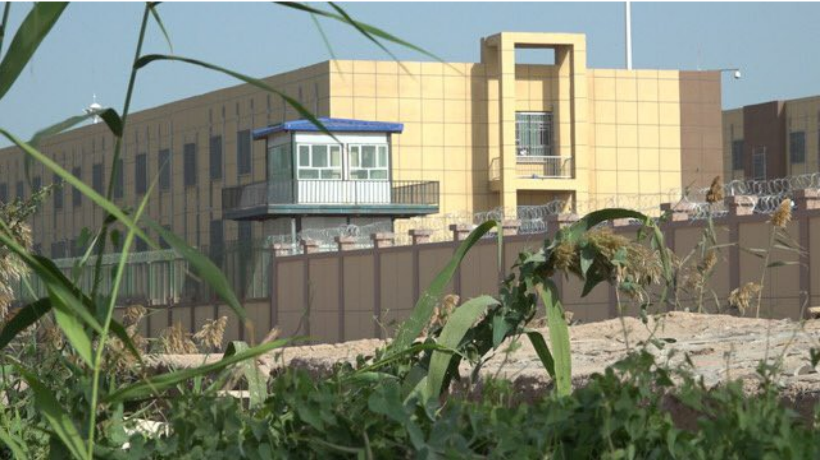
Satellite Imagery of Xinjiang “Re-education Camp” №2 新疆再教育集中营卫星图 . © Shawn Zhang.

The secrecy surrounding these camps has made understanding what goes on in each particular facility a challenge. As a collective, however, a combination of first-hand accounts and open-source journalism has begun to piece together a more comprehensive picture in what continues to be a highly dynamic and evolving situation. 59 Between 1–3 million (likely at least 1.8 million) 60 Uyghurs and other ethnic minorities have been detained in extrajudicial centers—excluding the large number already incarcerated. The most recent estimate of 1.8 million would equate to about 15.4% (or almost one-sixth) of the adult Turkic and Hui population, and probably includes far more camps than are currently known. 61 In the second half of 2018,