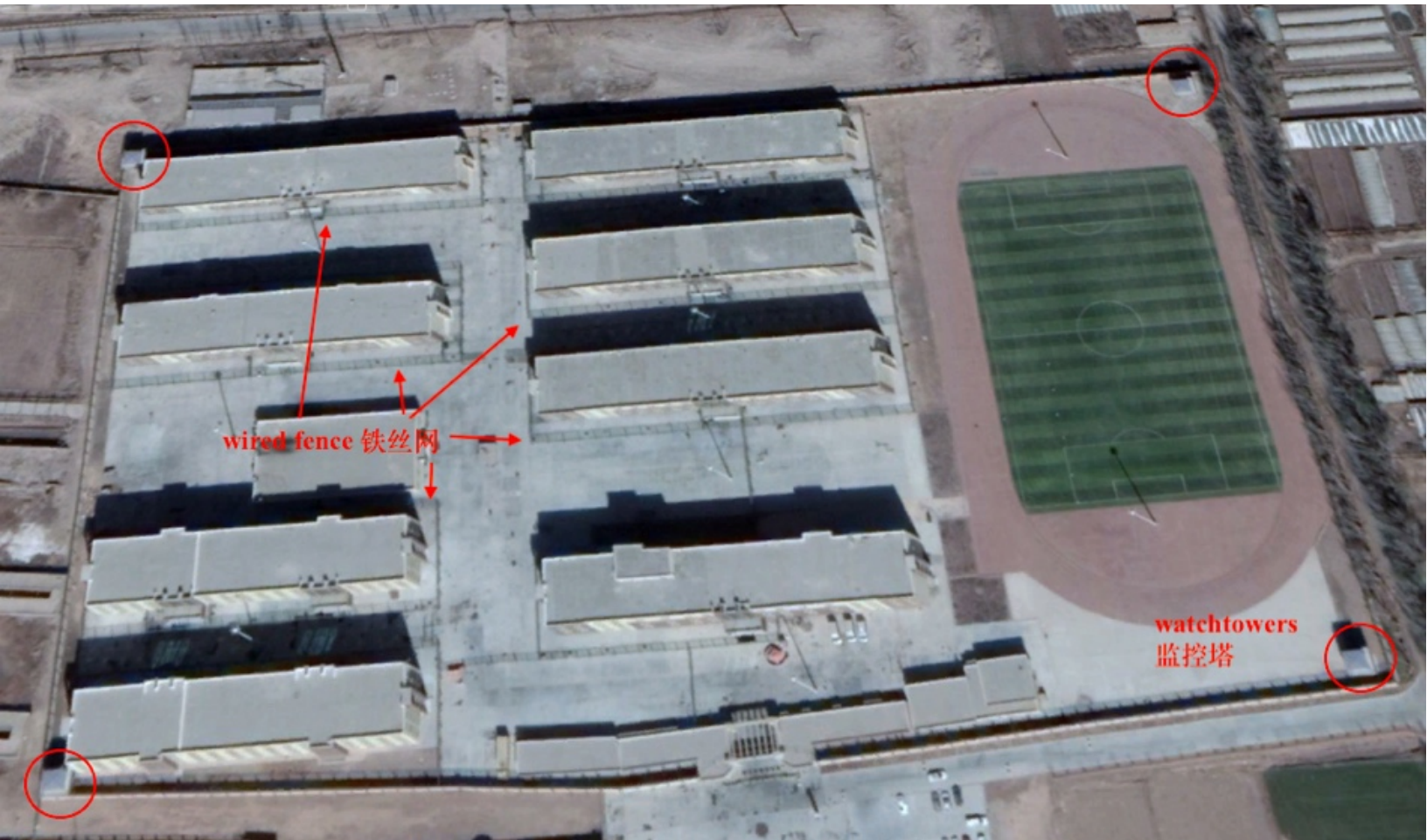
Satellite Imagery of Xinjiang “Re-education Camp” №2 新疆再教育集中营卫星图 . © Shawn Zhang.

The external appearance of the camp can be seen depicting watchtowers, barbed wire, and bars over windows (p.34).