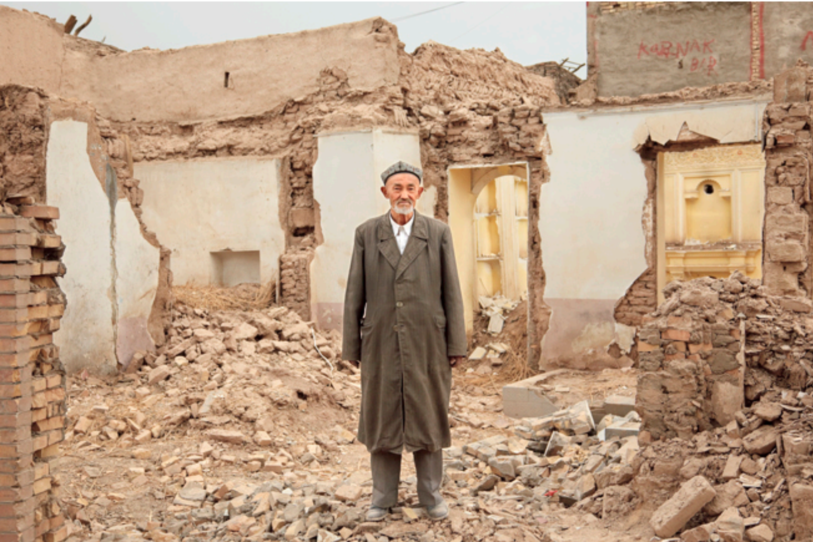
Kashgari man standing on the site of his former home, August 2011.

Though it would be difficult to verify, indications suggest that the government was successful in demolishing its planned 85% of the Old City, and likely more, given that it even reconstructed some areas initially slated to be preserved. Indeed, the Global Heritage Network's (GHA) Site Conservation Assessment Report of Kashgar estimates that 90% of the Old City was destroyed. 52 Atmospherically, the effect was totalizing. Not only did the inhabitants go through the devastation of seeing their (sometimes centuries-old) ancestral homes destroyed, those who were able to return saw the city rebuilt in a performative, tourist-friendly shadow of its former self. The process unfolded