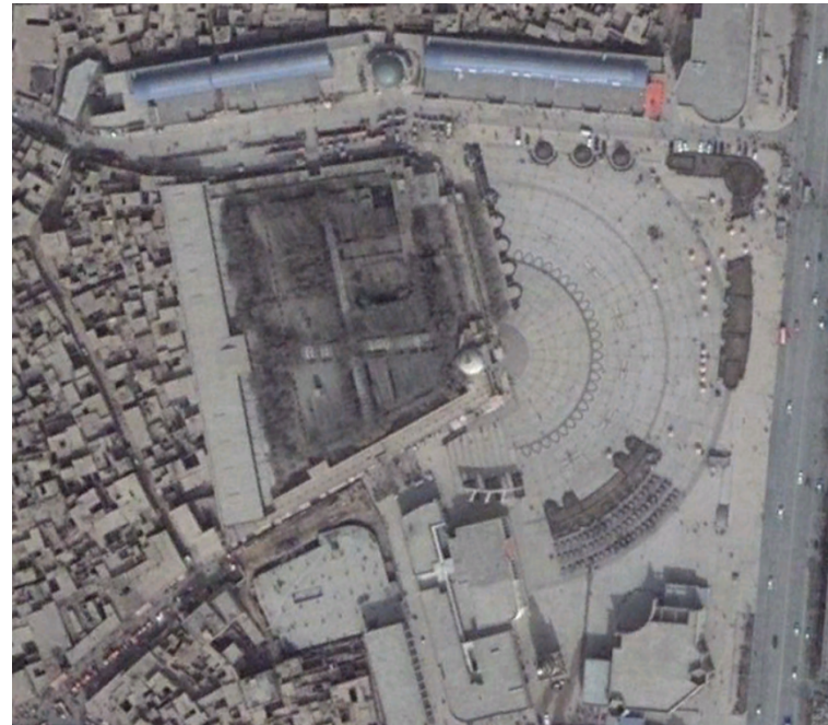
Id Kah Square, 3/6/2005, showing new shopping complexes to the north and south of the square, and rose garden removed.

far as 2002, meaning that satellite evidence of much of the initial market clearing does not exist. However, satellite images do recount the subsequent destruction and removal of the iconic rose garden once tightly associated with Id Kah Mosque, and some surrounding homes removed on the north side of the square, replaced by commercialized shops.