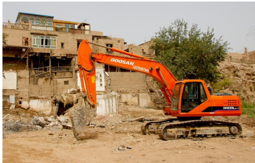
Historic neighborhood at risk.

The neighborhood in question was famous for housing stalwarts of Uyghur culture who resisted Old City reconstruction with notable fervor. While getting any reliable information out of Kashgar is a