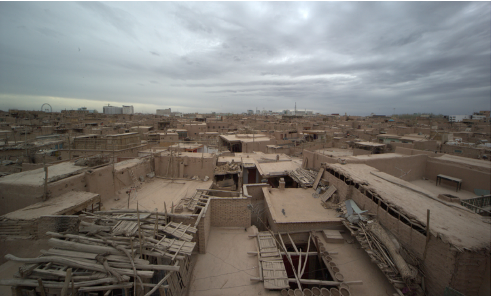
Traditional Kashgar Old City Courtyards , 2005

Moving beyond the complexity and interwoven-ness of the Old City as a whole, we can consider the construction features of the houses themselves, dense with social meaning and cultural praxis. We first consider the locations of the houses in proximity to the city's mosques. As Liu and Yuan have plotted, the Old City was speckled by 112 fairly evenly dispersed mosques, each of which would serve 10–25 households within a radius of 50–100 meters, 15 creating an ecosystem of embedded religious practice within the community.