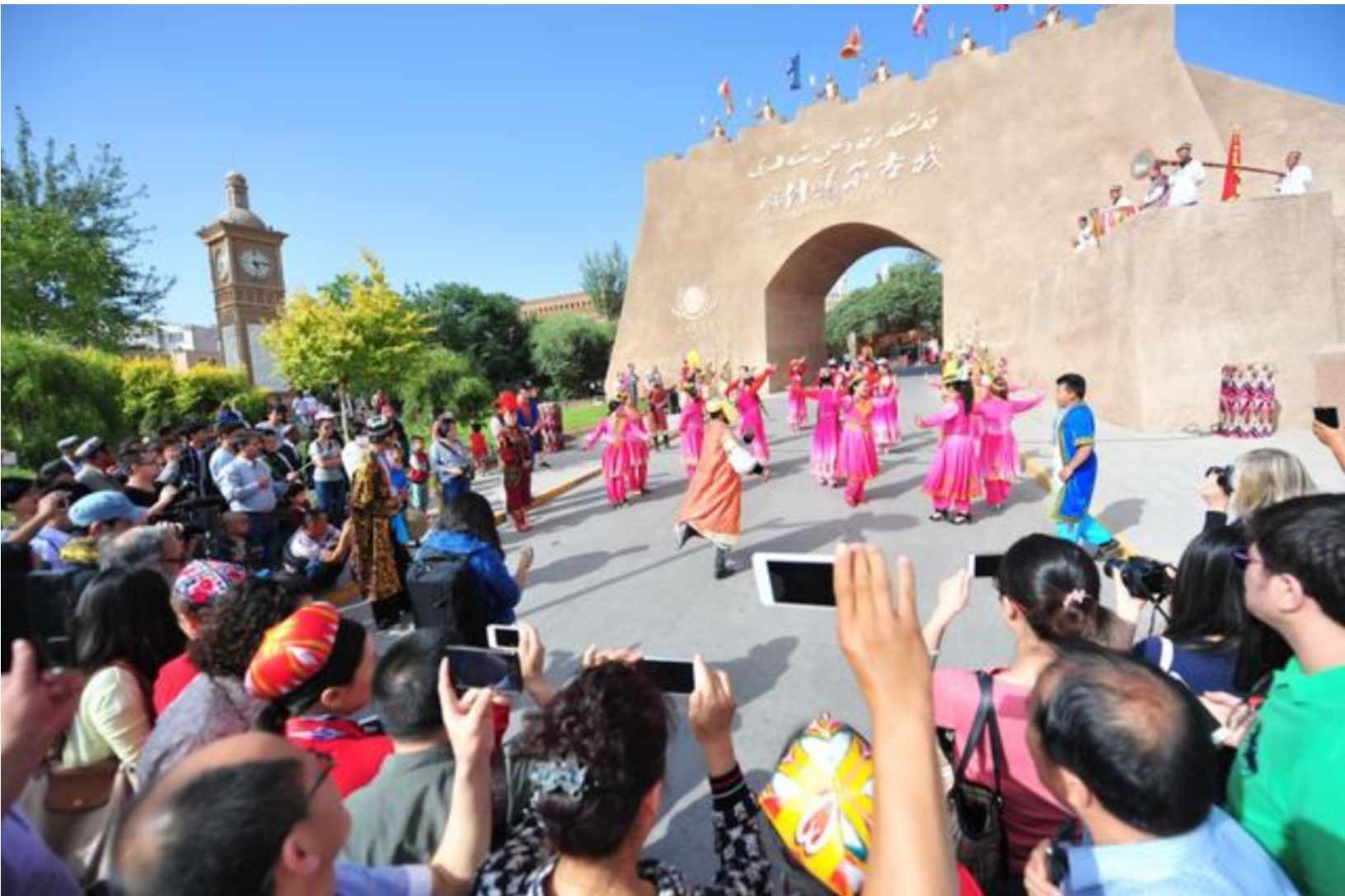
A commercialized traditional dance periodically performed for tourists outside of the Old City's (reconstructed) main gate.

Outside of the Old City, the broader economic transformation of Kashgar continued and accelerated. In May 2010, Kashgar was designated a new special economic zone, and paired with Shenzhen, the fishing village turned high-tech metropolis as a development partner. 104 In a bid to attract capital and settlers to Kashgar, the Chinese central government afforded the city a slew of tax breaks, investment incentives, and lighter regulations to start new businesses. Shenzhen contributed USD$1.5 billion in the program's first year to support the project, as Kashgar radically expanded its industrial parks, including a