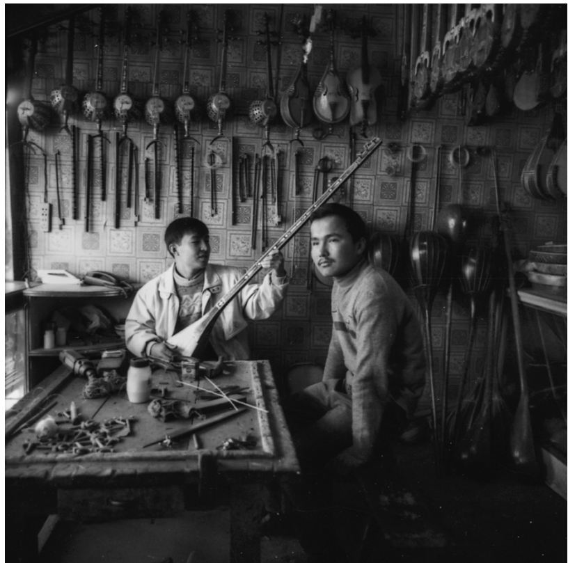
Traditional Uyghur instruments and wooden store front in 1998 Kashgar.