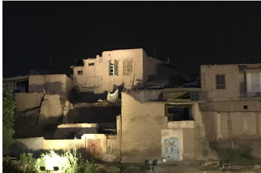
Night shots of Kozichi Yarbeshi abandoned, with dilapidated houses, electrical boxes removed, padlocks, and X's on doors. October 2018.

Recent photos by one tour guide from the region confirm the presence of heavy demolition machinery near the neighborhood: