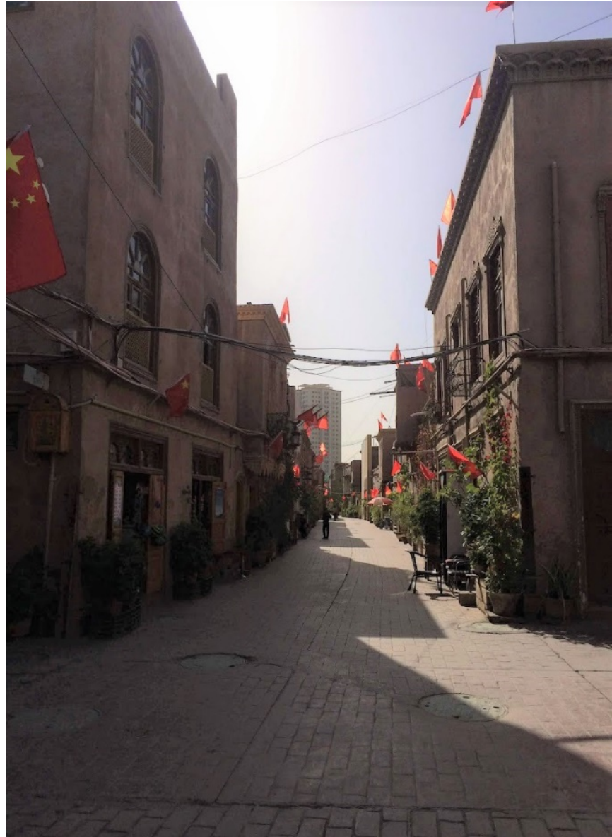
'Islamic Lego' style architecture post-reconstruction, widened and squared streets with Chinese flags. Author's photo, 2018.

buildings, more of which will probably fill the huge area—around ten city blocks—that have been cleared at the foot of the hill. It was strange to see such a vast open space in the heart of a city; it was as if there'd been some kind of disaster. . . .