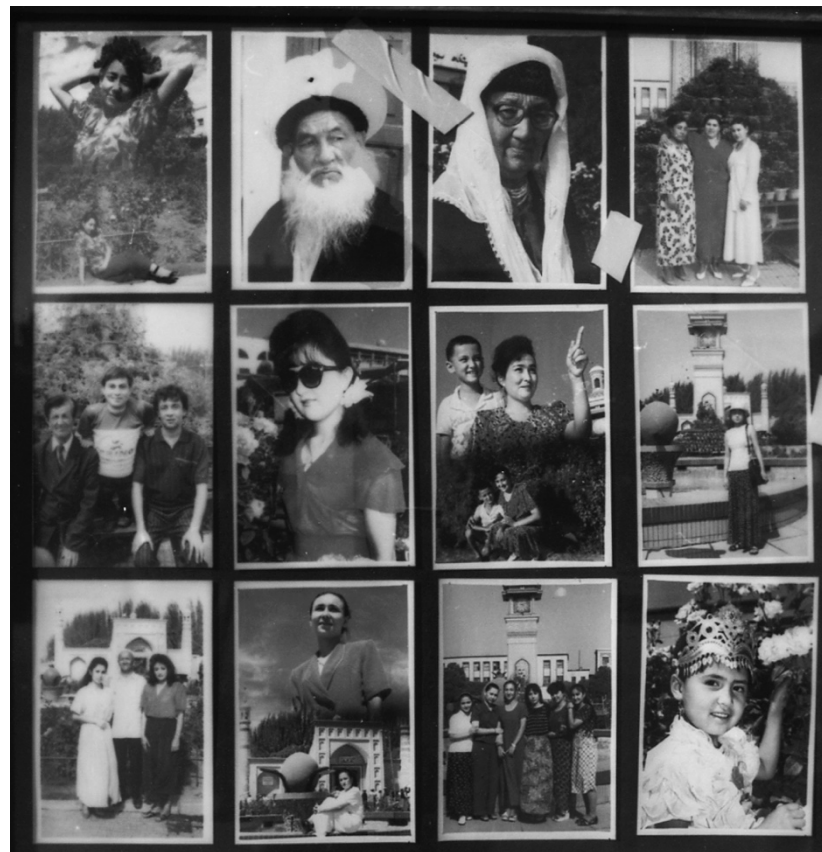
A wooden stall of the type that used to be seen in Id Kah Square; tourist photos in front of the old rose garden.