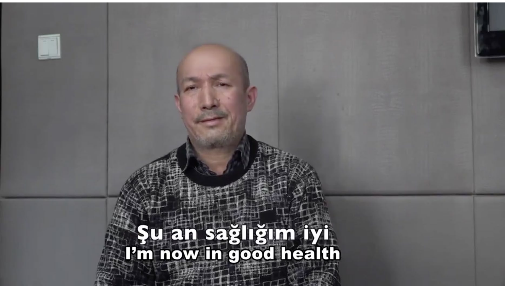
Screengrab from a video of Abdurrehim Heyit released by China Radio International's Turkish service in February 2019.

After rumors of Abdurrehim Heyit's death circulated online in February 2019, Turkey's Ministry of Foreign Affairs confirmed his death. 31 This confirmation provoked China Radio International's Turkish-language service to release a proof-of-life video on Twitter that claimed that Turkey's criticisms were unfounded.