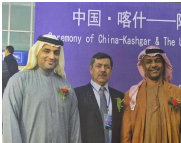
Image 5: Abdujelil Helil at the opening ceremony of the Kashgar-UAE charter flight.