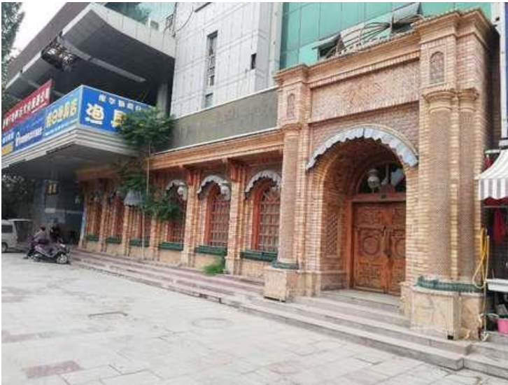
Image 9: Image from Taobao auction site depicting Ruzi Hemdul's Jewher Restaurant in Korla.