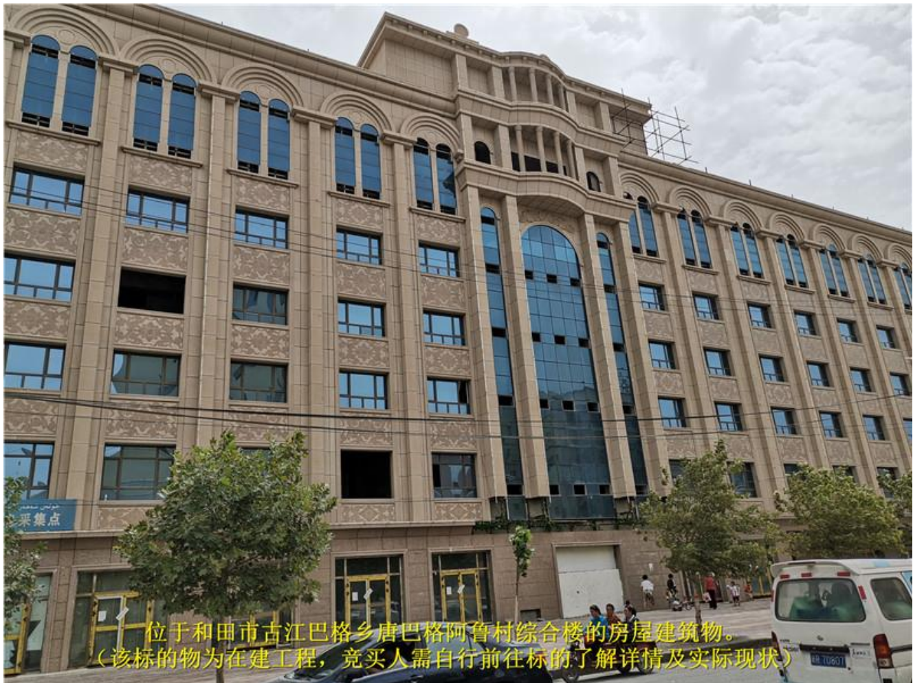
Image 13: Building in Hotan belonging to Abdunabi Bekri.

w.7398504.paiList.15.39466178qtpPTB&track_id=37130990-fe8d-4ad4-b85a-88b7e786678f , archived here .