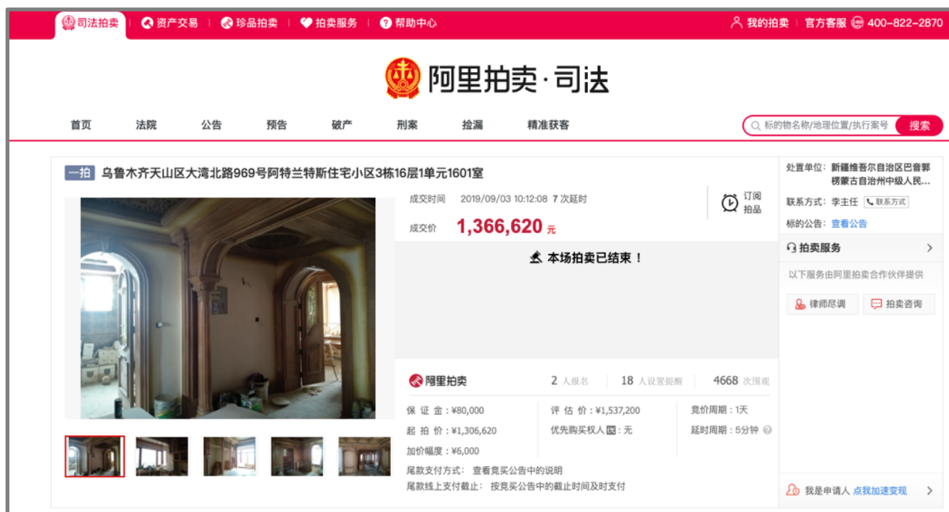
Image 1: screenshot of the webpage for the sale of an apartment belonging to Ruzi Hemdul on the Taobao judicial auctions website.

dispossession of Uyghurs particularly disturbing. Seizure of property has been a feature of genocides throughout history. 11