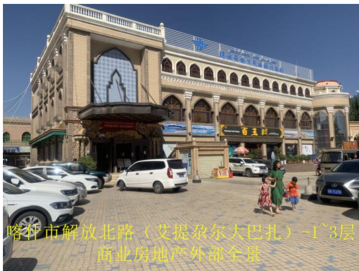
Images 3 and 4: Building belonging to Abdujelil Helil in old town Kashgar.

An August 2021 search of China Judgments Online for Abdujelil Helil returned only two documents, both related to the building in Kashgar. The Kashgar Agricultural Bank filed a lending contract dispute with Abdujelil together with two other individuals over a loan of 40 million yuan (over US$6 million). The court seized the building, appraised at 76,636,300 yuan (US$11,820,934), in August 2018. 22 His wife's objections to the seizure were dismissed by the Kashgar Intermediate People's Court in January 2021. 23 It is possible