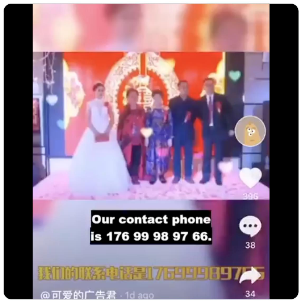
Screengrab from a video posted in 2018 appears to show a coerced or otherwise forced marriage between a Uyghur woman and Han man.

on viewing them, stating that such videos were "evidence of forced racial assimilation."<sup>38</sup> In the posted videos, the Uyghur women appear distressed during the wedding ceremonies, prompting viewers' concerns that the marriages are forced or coerced.