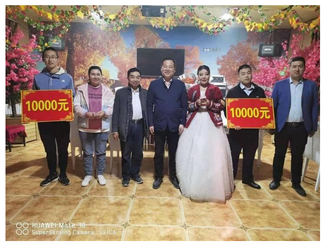
Photo of a village team standing with a newlywed Uyghur-Han couple in Aksu County.

Since 2018, headlines of stories in official media have consistently highlighted financial incentives for interethnic marriages. For example, the Hong Kong newspaper Ta Kung Pao , which is owned by the Chinese Party-State and controlled by China's representative office in Hong Kong, ran a short Chinese-language article in November 2018 with the headline: "To Encourage Interethnic Marriage, Xinjiang Gives Rewards of 10,000 yuan ."<sup>48</sup> The report begins with a discussion of the 2014 Cherchen measures – not exactly news in 2018 – and then briefly mentions three other examples of interethnic marriage, none of which relate to Cherchen County.